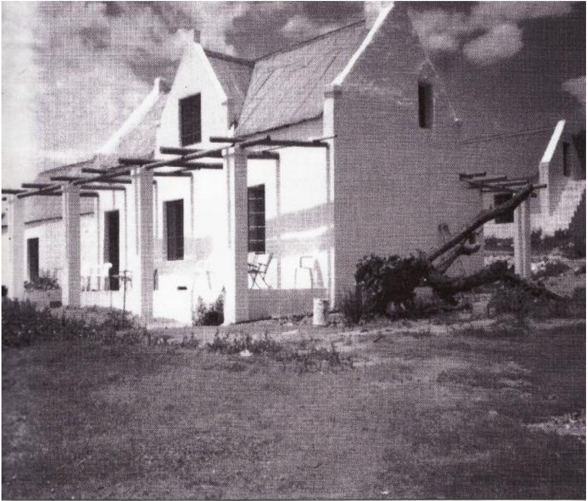
Olive Grove homestead after restoration in 1995.