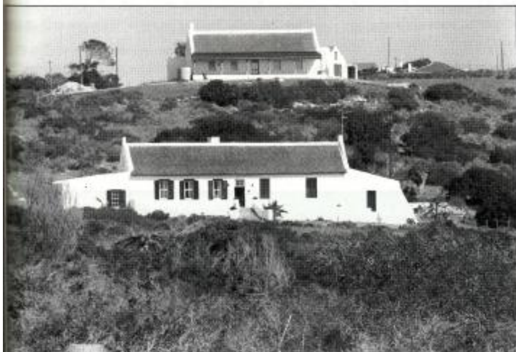
The homesteads Palinggat (front), Jagersbosch (back), after restoration. Both were declared National Monuments.

The outside room on the north side was the schoolroom and it is said that elephants